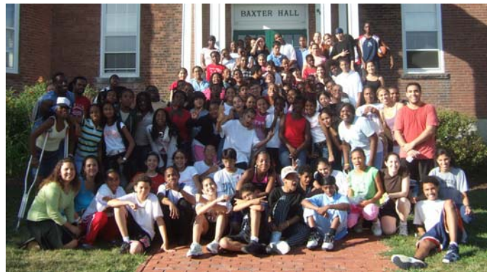
Class of 2009 & Class of 2010 at Kimball Union Academy

For more information or to apply, contact: Candy Crary, 212-430-5980 x1102 ccrary@oliverscholars.org