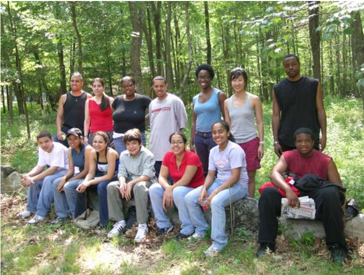
First Mentor/Mentee Matches at High Ropes Course

Boarding Schools: Concord Academy • George School • Governor's Academy • The Groton School • Milton Academy • Peddie School • Phillips Academy Andover • The Westtown School